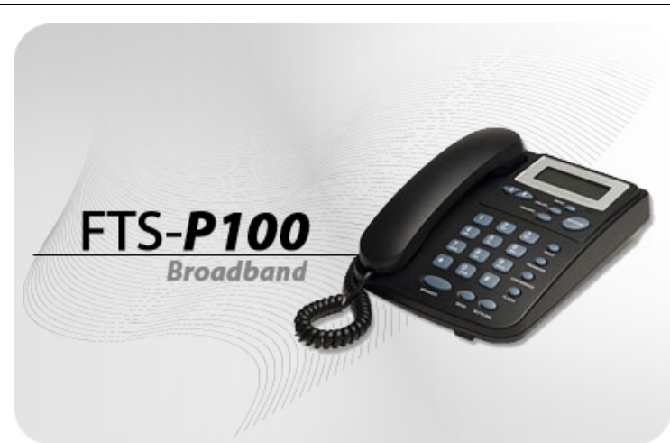
FTS-P100 Broadband Internet Telephone