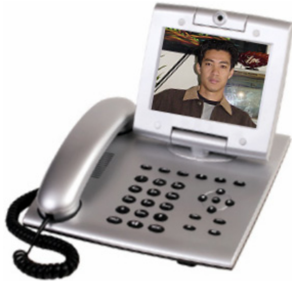
FreeTEL System FTS-V100 IP Video Phone Revision 1.0